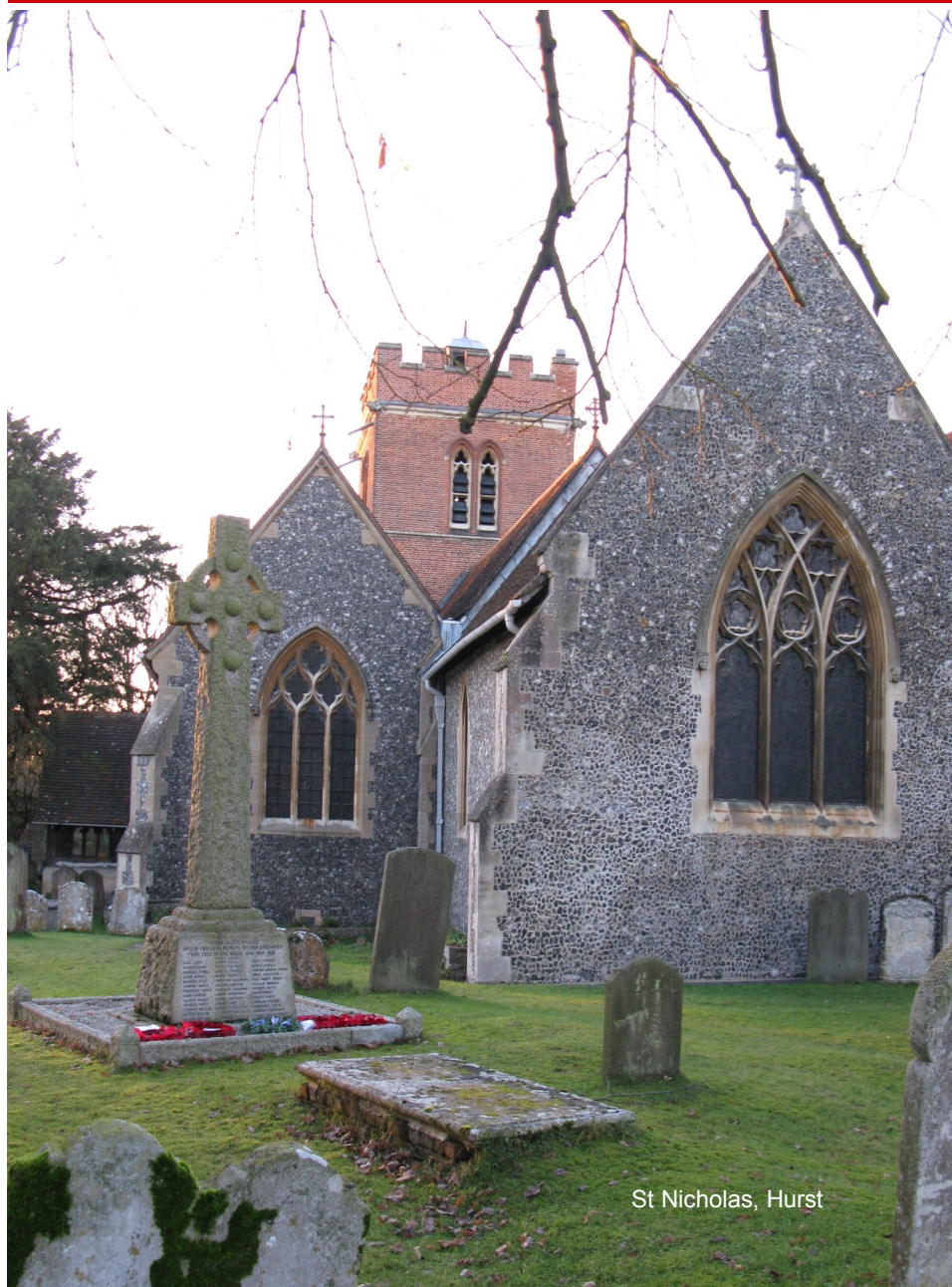
St Nicholas, Hurst