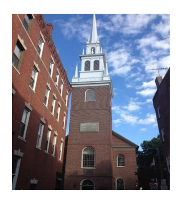
The Old North Church in Boston